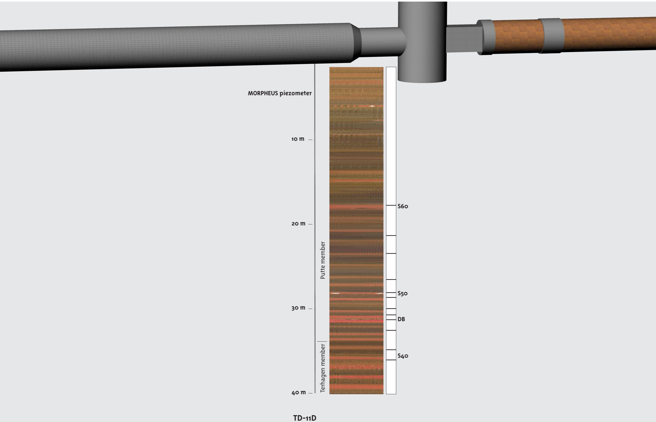
BOOM CLAY STRATIFICATION AT THE MORPHEUS VERTICAL BOREHOLE